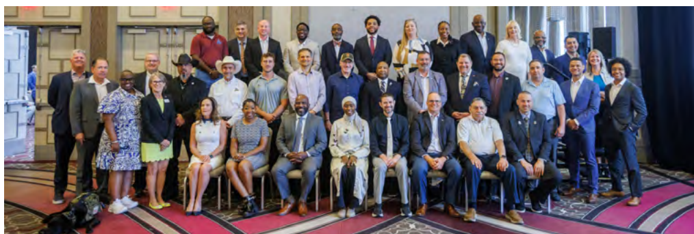
Fellows pictured with Senior Fellows